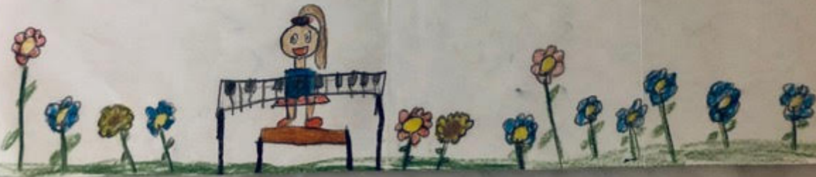
The Pratt Music Foundation has been supporting student musicians for 24 years, and none of our work could have happened without your support. Thank you.