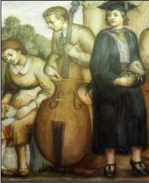
The WPA mural in the Normal Post Office points out that music education has long been an important part of our communities.